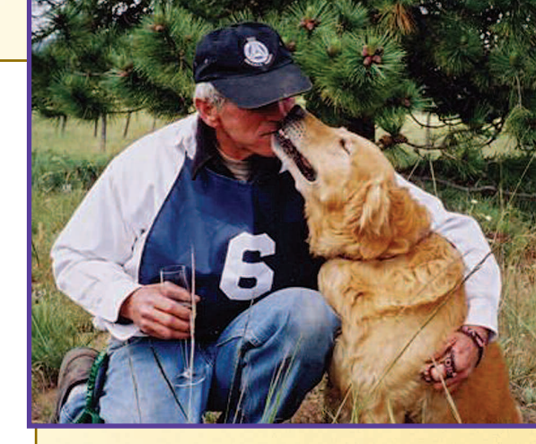
Top: The team celebrates after becoming Finalists at the 2003 U.S. Amateur National, McCall, ID.

My favorite series when running Boomer was the water blind. Whenever